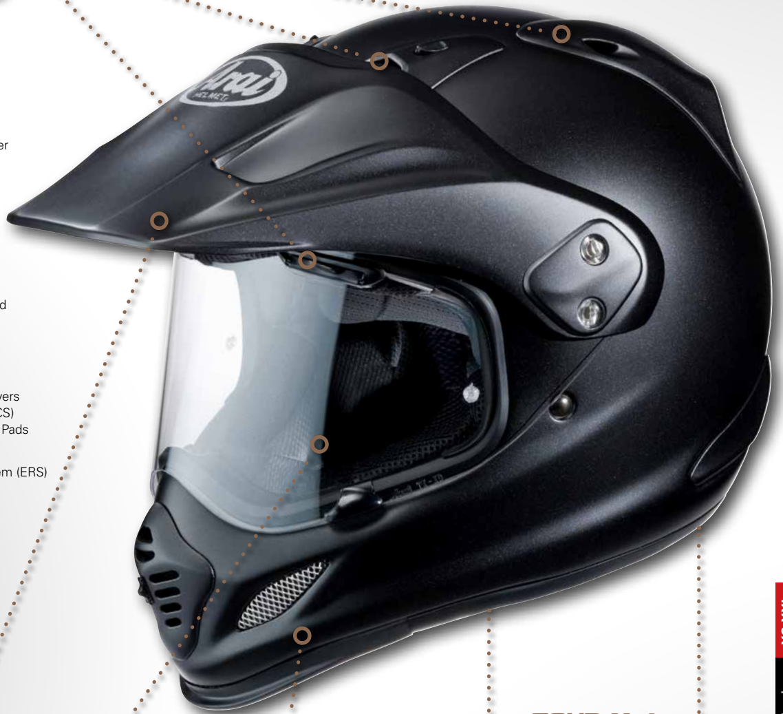
TOUR-X 4 Frost Black

** Innovated and exclusively offered by Arai